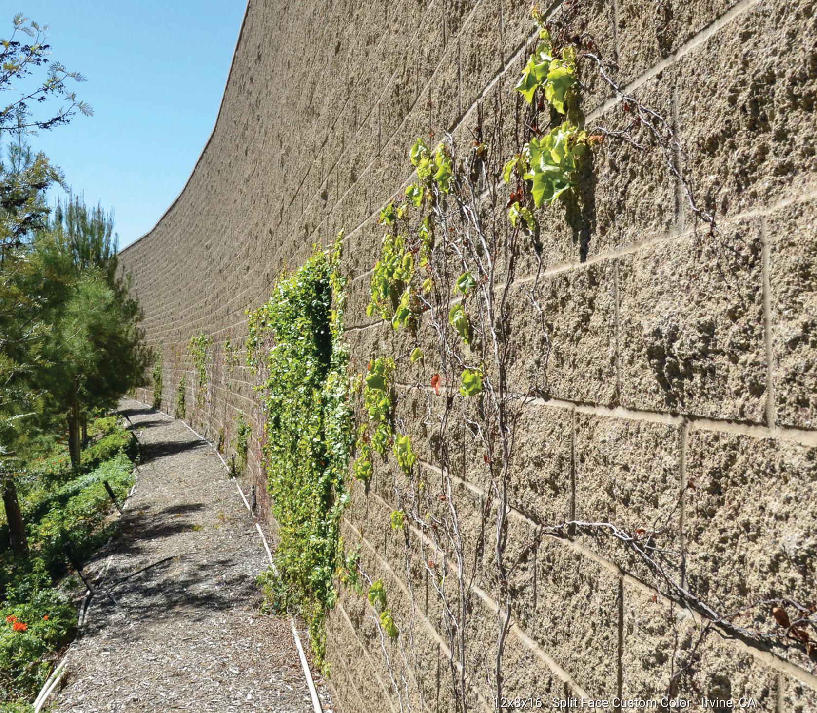
12x8x16 - Split Face Custom Color - Irvine, CA